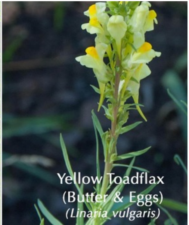
Yellow Toadflax (Butter & Eggs) ( Linaria vulgaris )