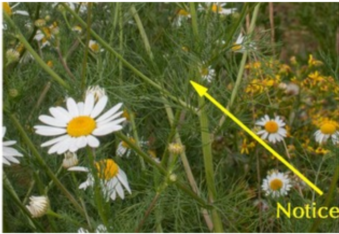
Notice the very fine, thin leaflets