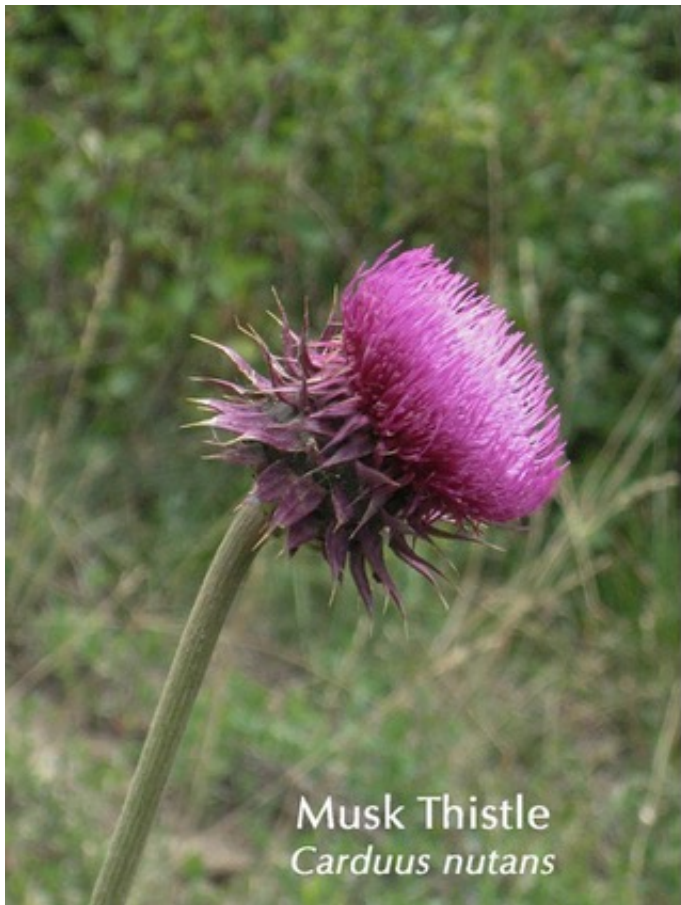
Musk Thistle Carduus nutans