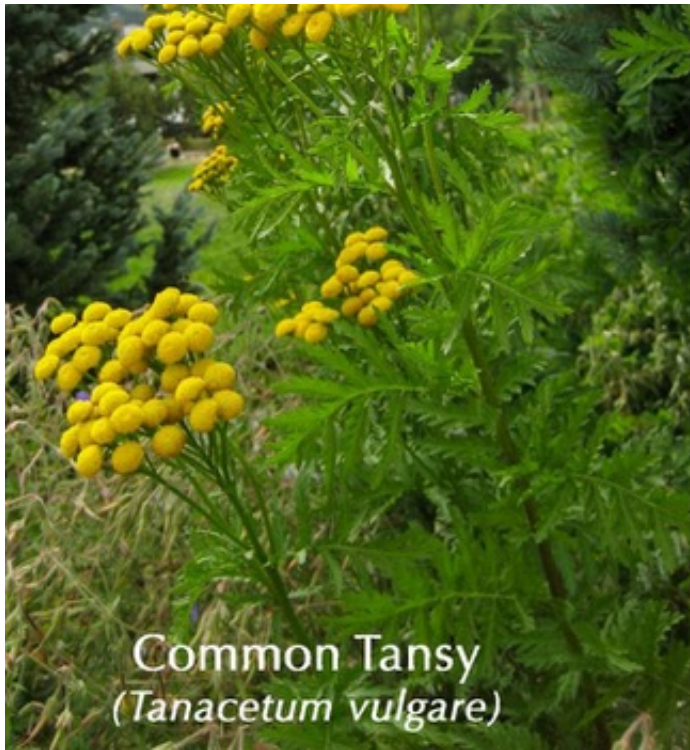
Common Tansy ( Tanacetum vulgare )